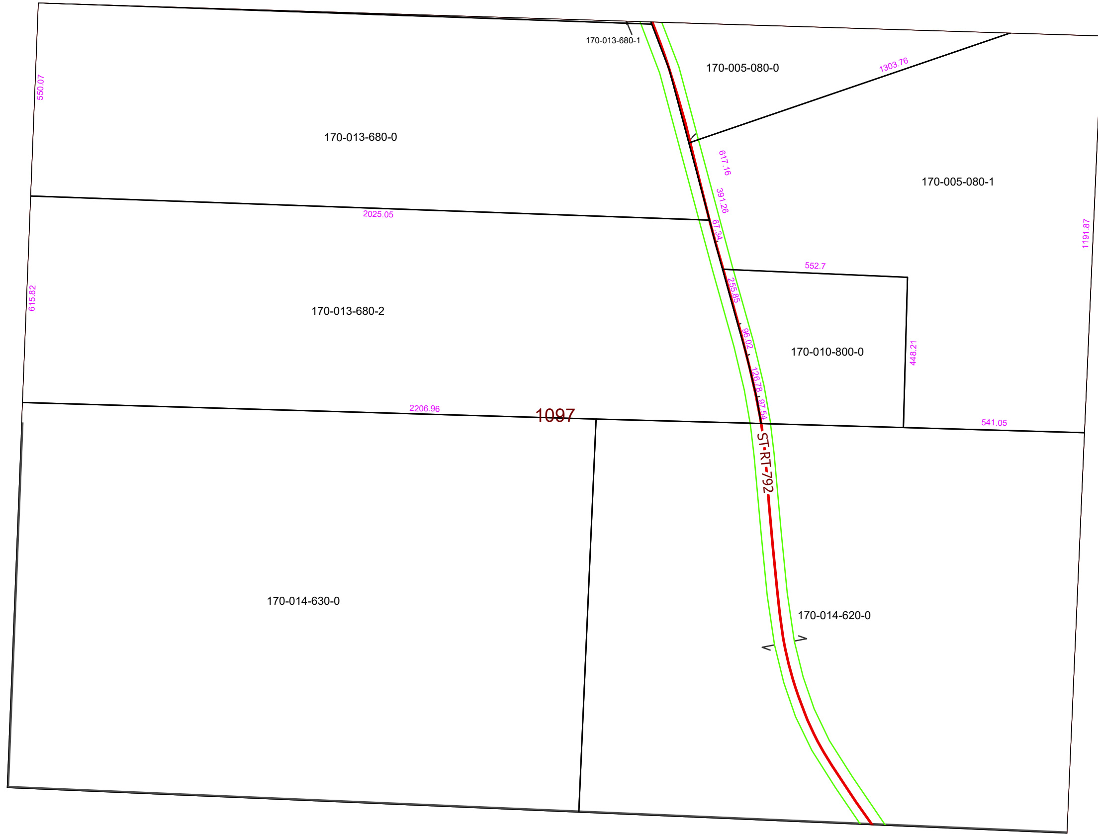
WINDSOR TWP. FRAC. 1097, T-8, R-11, OHIO CO. PURCHASE